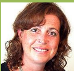
Nedret Emiroglu WHO-Eurov